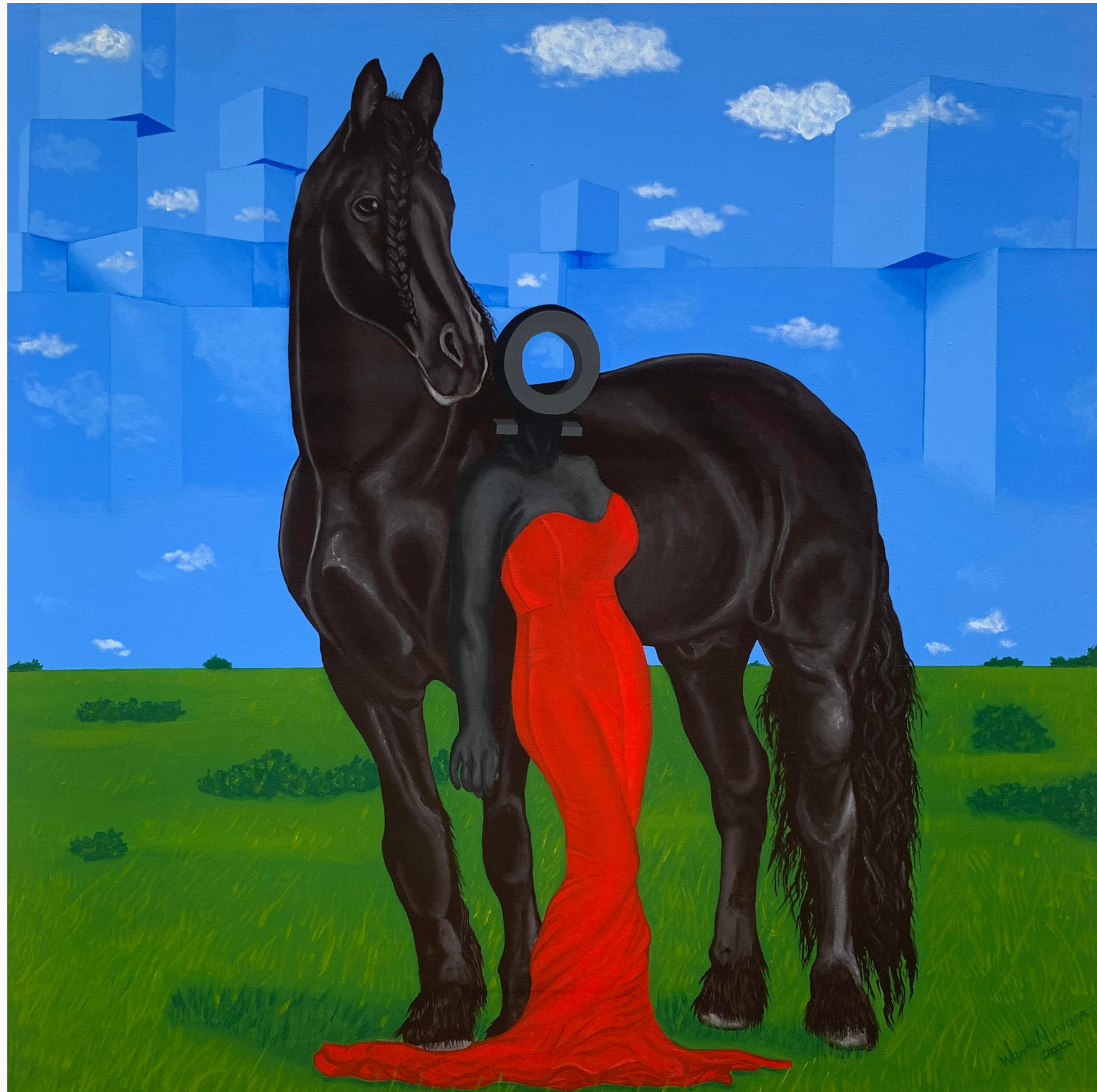
Dauntless Acrylic on Canvas 30 x 30 inches 2022