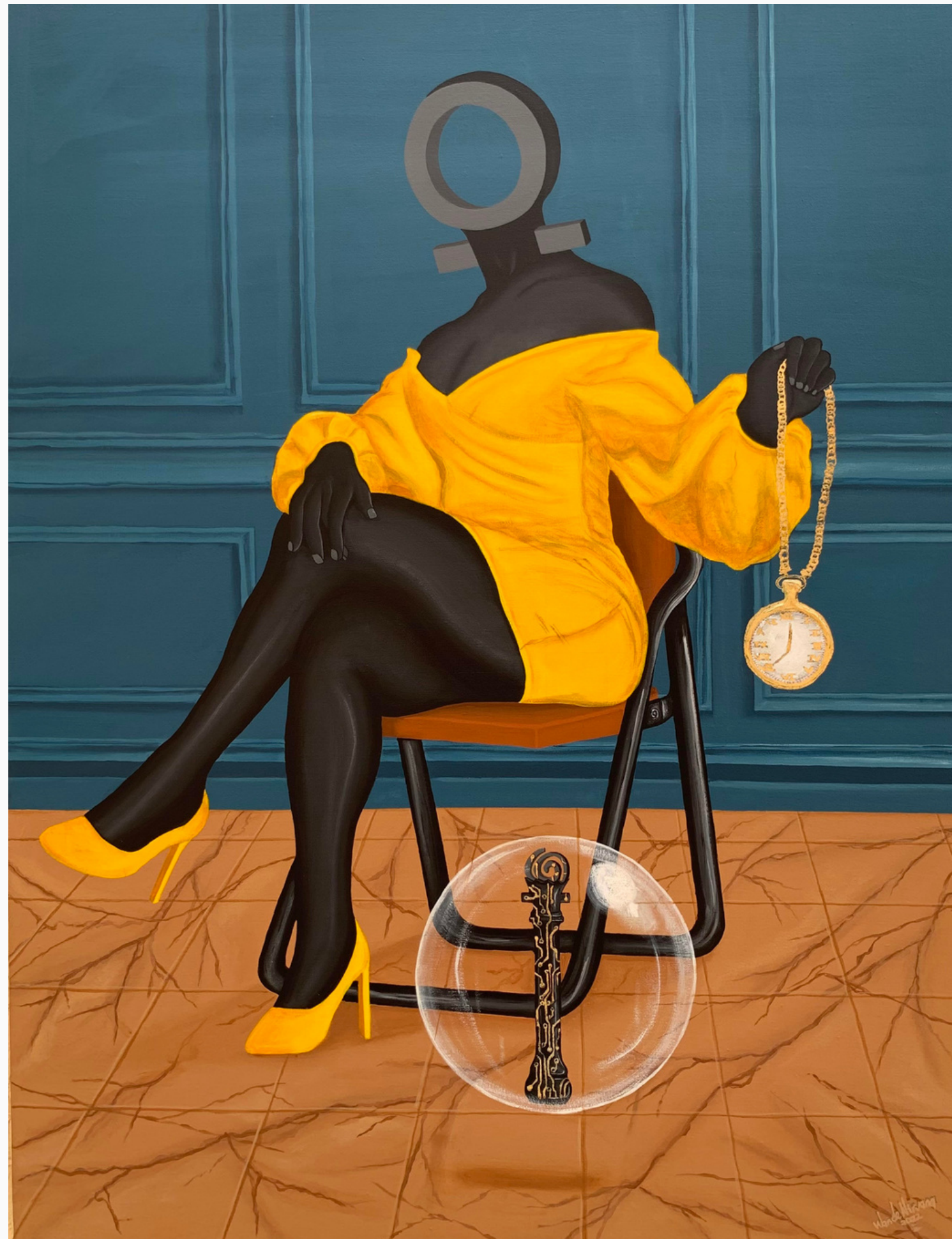
Tick Tock Acrylic on and gold leaf on Canvas 42 x 32 inches 2022